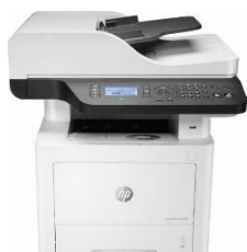
HP MFP 432